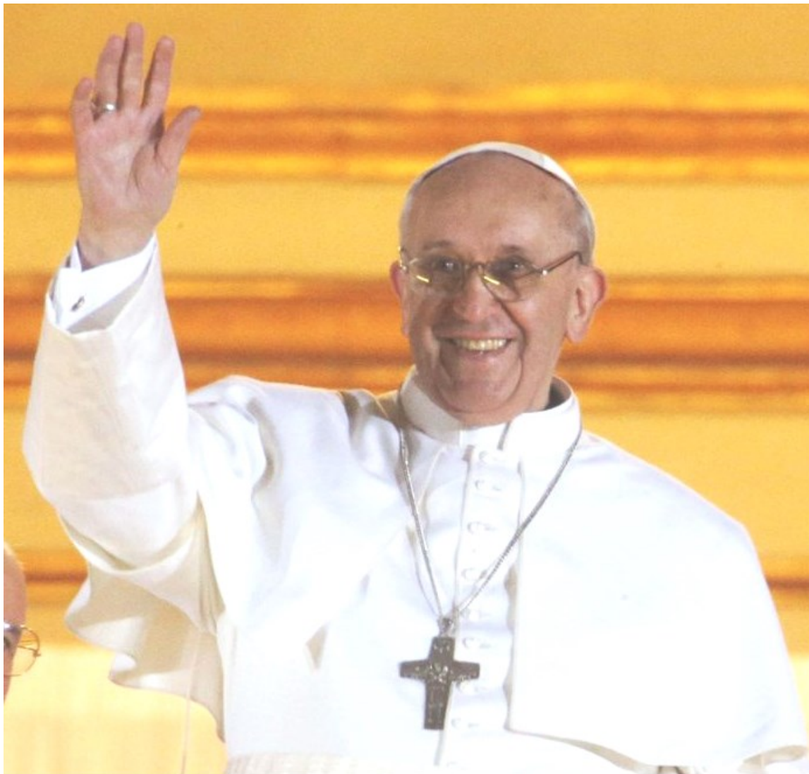
His Holiness Pope Francis

BRINGING THE GOSPEL TO THE UoA FOR 85 YEARS