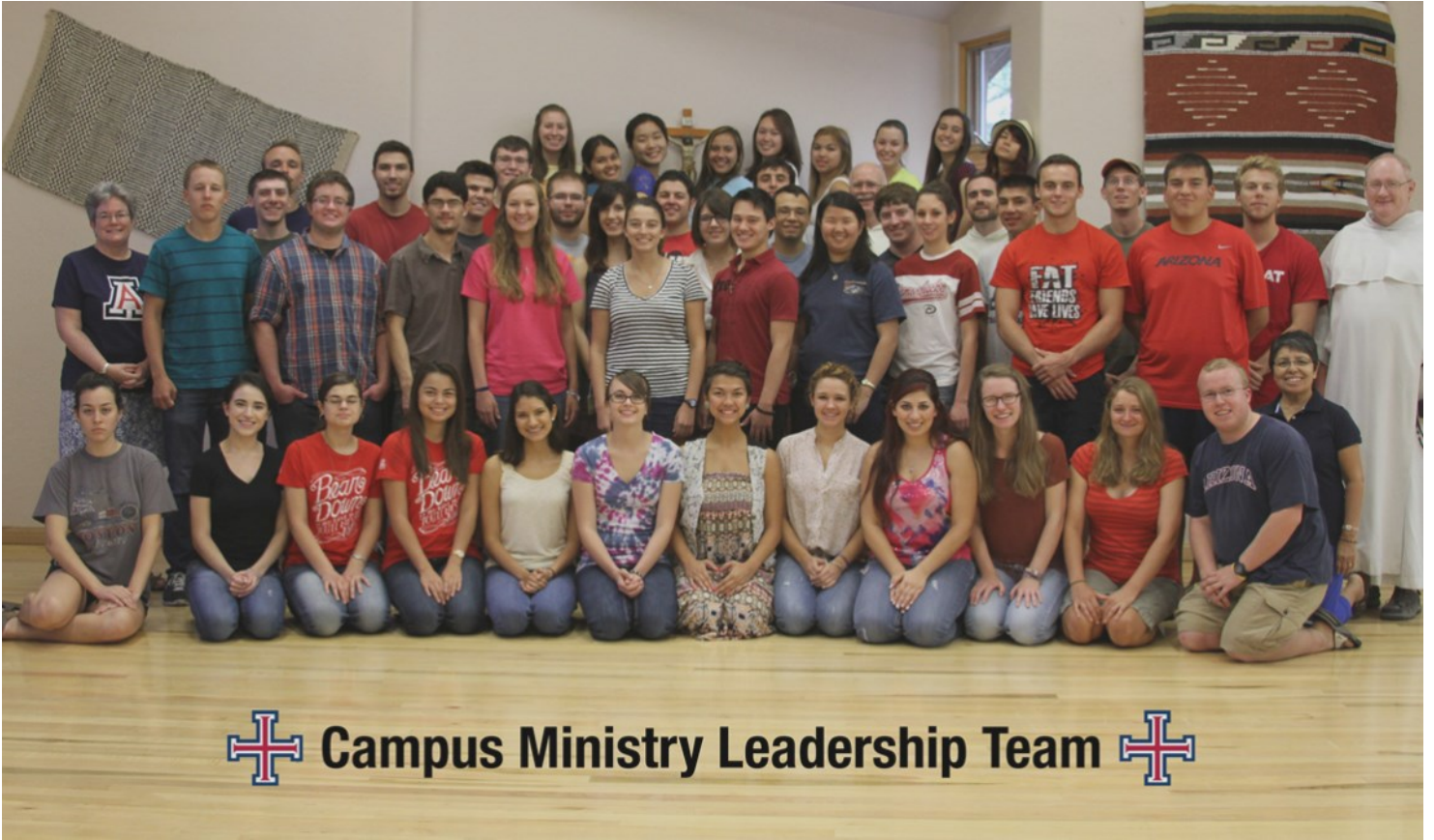
✠ Campus Ministry Leadership Team ✠

September 7-8 23rd Sunday in Ordinary Time