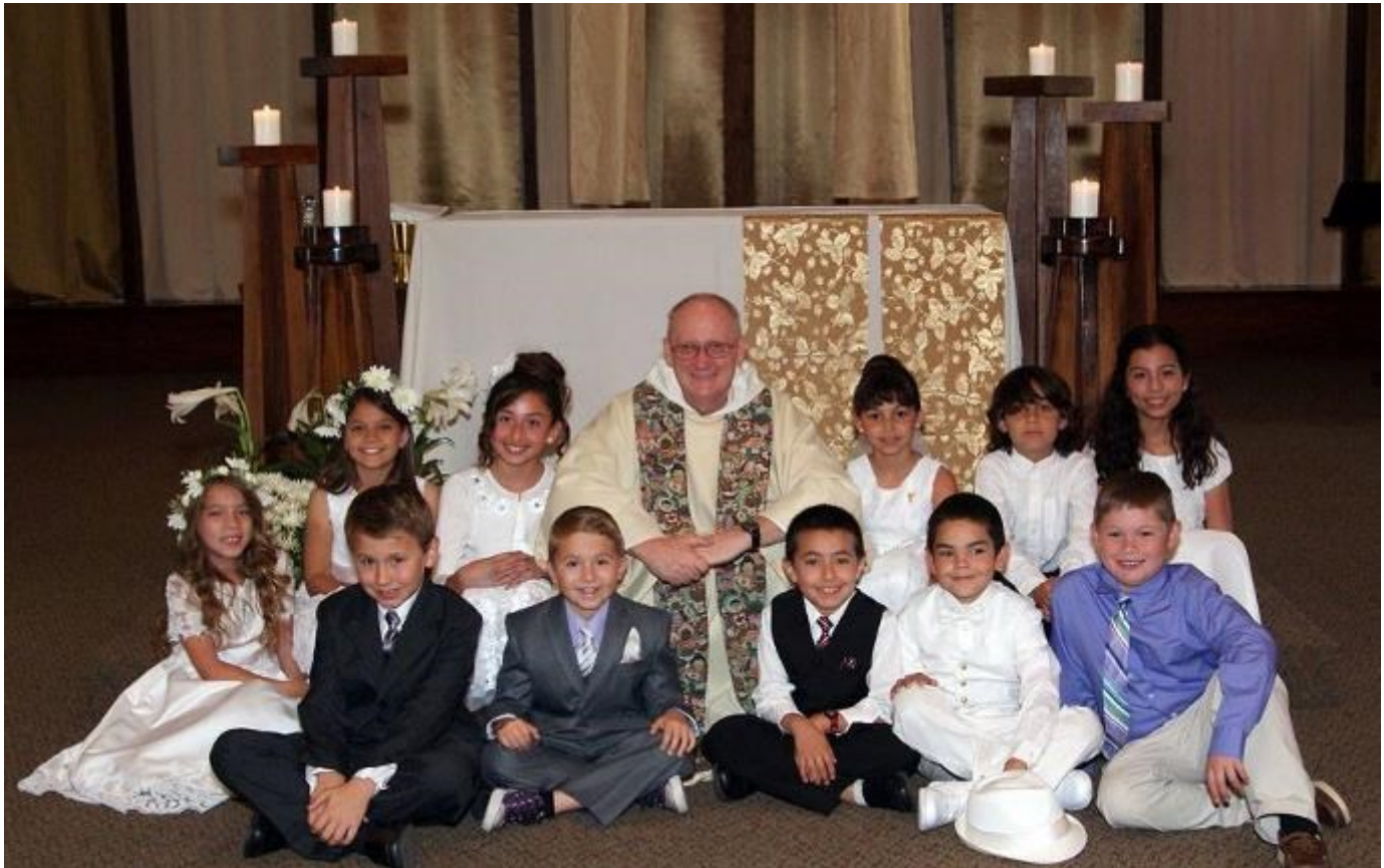
This Year's First Communion Class