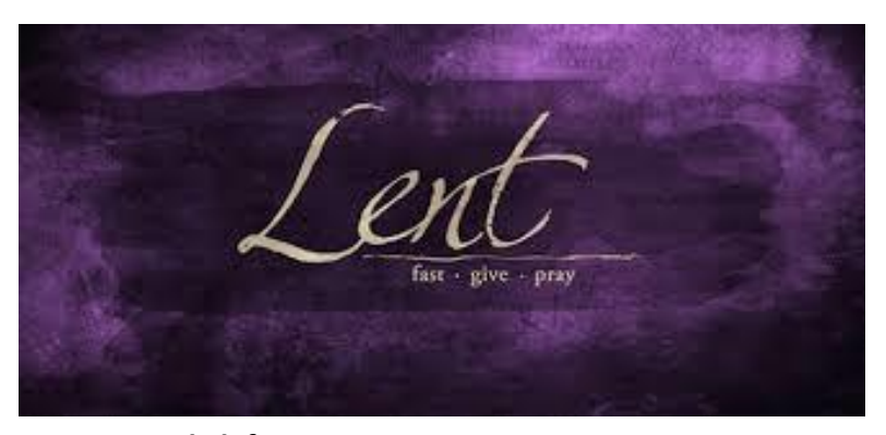
Click for our 2022 Lent Resource Page