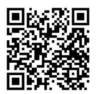
\label{lem:condition} \mbox{ View all giving options at: www.UACatholic.org/donate}

Parents of our university students, please consider supporting Newman as your son or daughter's parish-away-from-home.