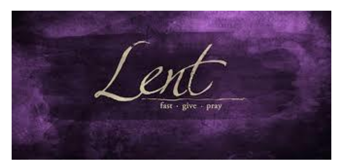
Resources at <u>UACatholic.org/Lent</u> Pick up a CRS Rice Bowl & Hallow App flyer at church entrances